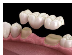
Bridge/fixed partial denture