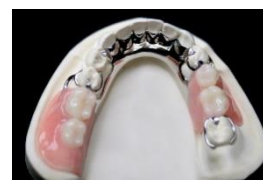
Removable partial denture