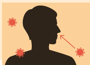
Without vaccines, germs can make us sick.

Vaccines have been shown as safe and effective in large trials of more than 20,000 people, including Native American participants.