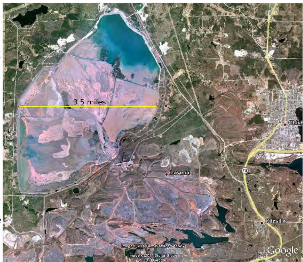
Hull-Rust-Mahoning (Hibbing) tailings basin, MN

The scale of the land alteration associated with taconite mining in Michigan and Minnesota is enormous, and is unlike what was known in the 1800s and the first half of the 1900s. U.S. Steel's Minntac mine project covers an area of approximately 20,000 acres. The Hull-Rust-Mahoning taconite mine near Hibbing, MN has a larger footprint, with a pit