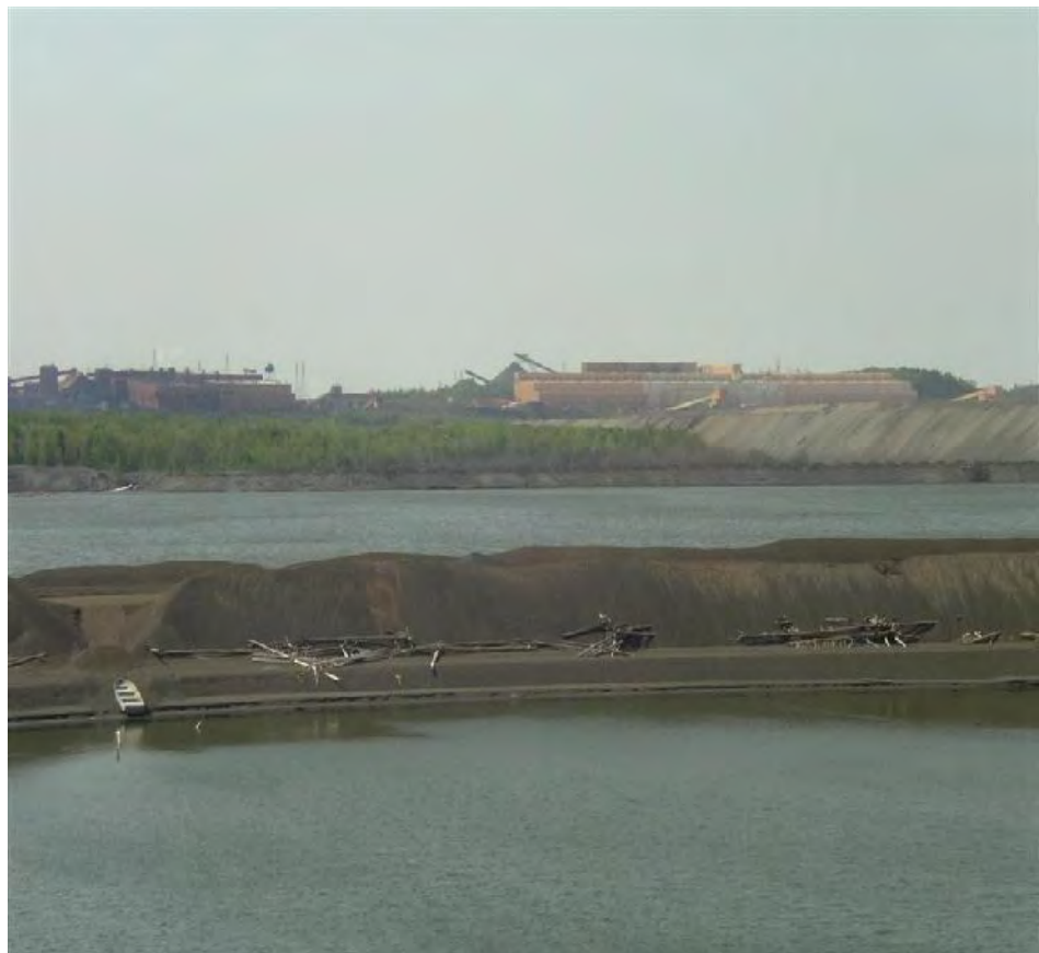
Tailings ponds and taconite processing facilities at Minntac, MN

Tailings, the non-iron material separated from the ore, consist of particles of crushed rock ranging from the size of coarse sand to fine powder. The character of the tailings depends on the chemical composition of the rock that was fed into the crushers and grinders. Tailings include non-target rock and minerals that are associated with the taconite ore, such as silica and pyritic shales. 6