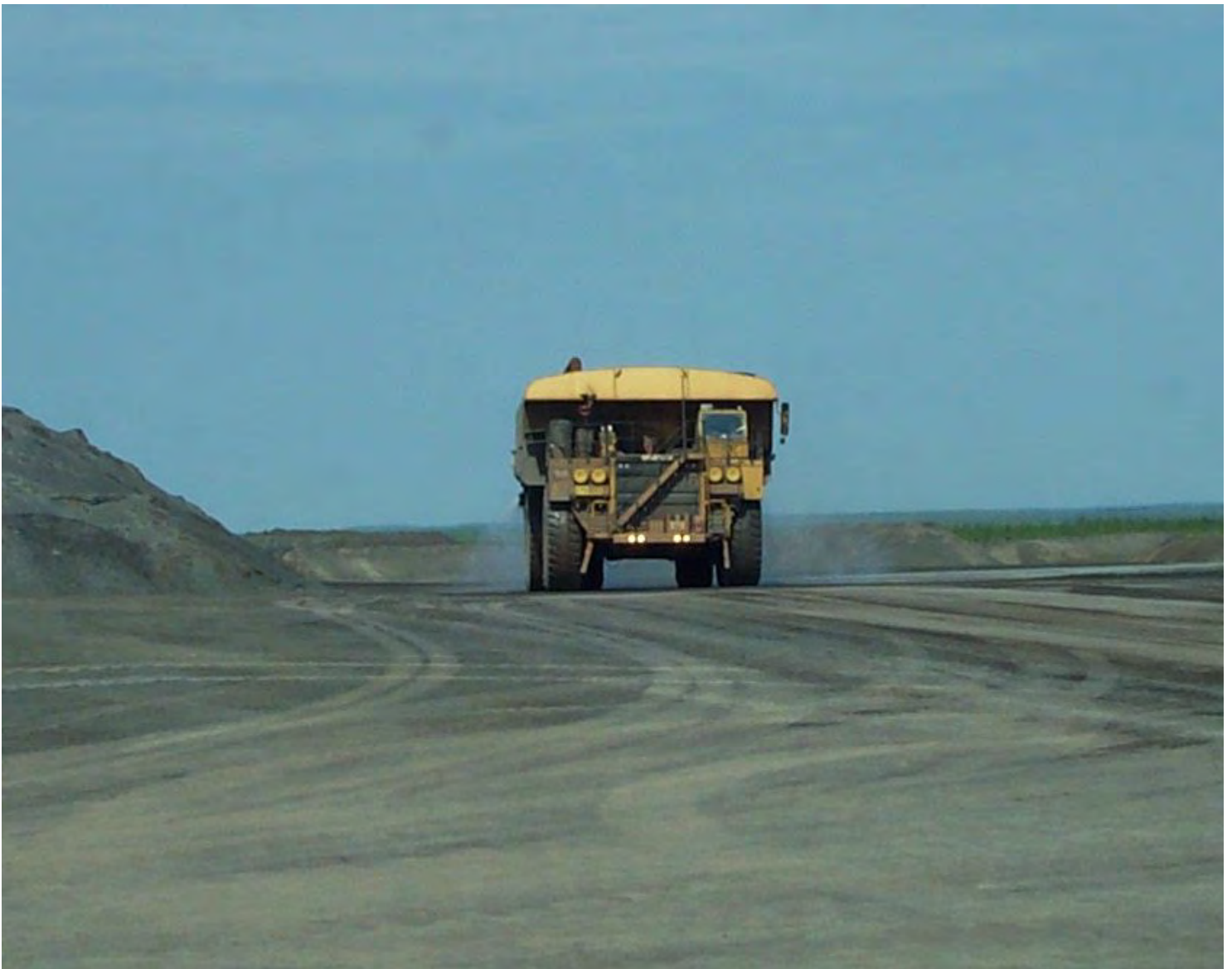
Haul truck on Minntac haul road, Minnesota.