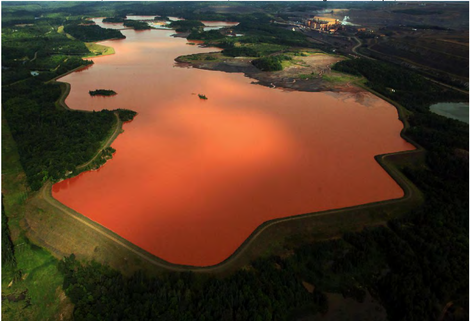
Tilden mine tailings basin, Michigan.