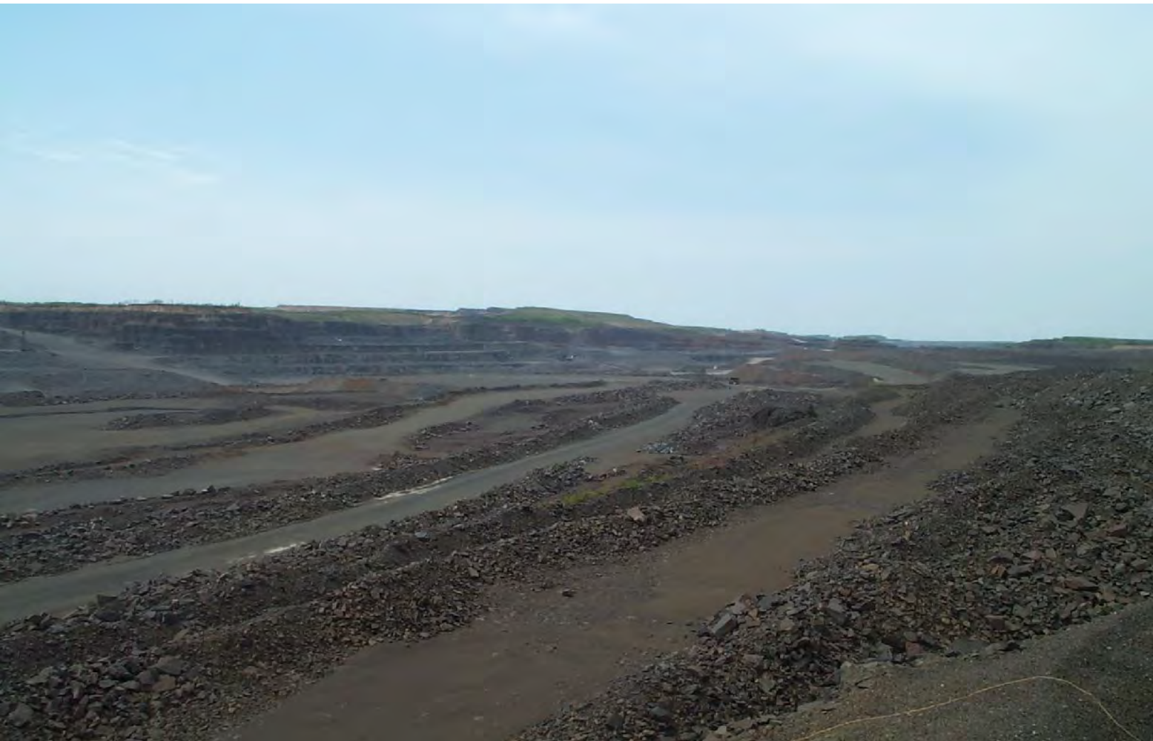
Minntac Iron Mine in Minnesota