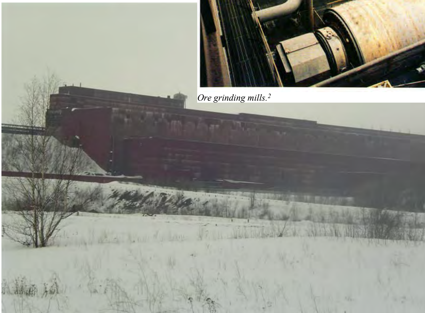
Taconite ore grinding facility, MN