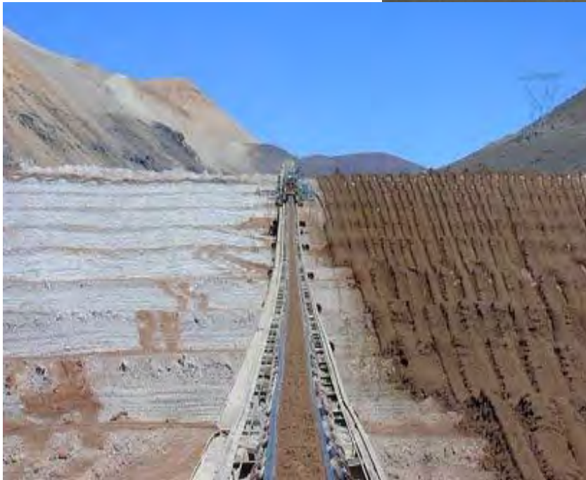
Dry tailings disposal in Chile. 6

may be proposed for use in the Penokee Range but dry stacking has not been previously used for low grade ores.