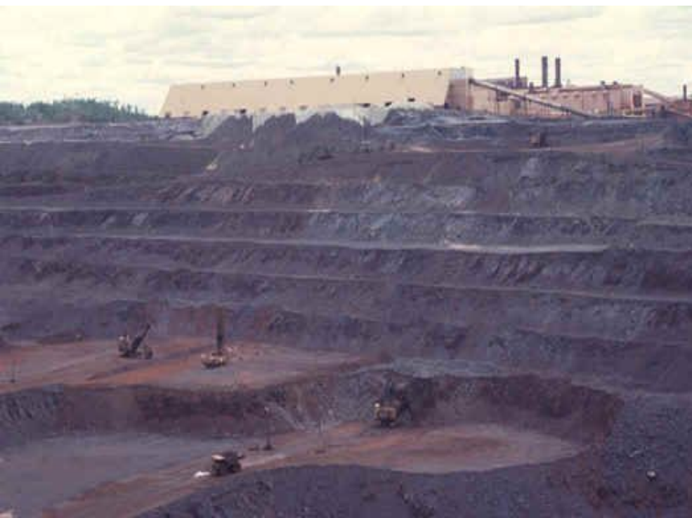
Taconite mine pit, Michigan.

Penokee Range. In Wisconsin, the taconite iron deposits of the Penokee Range are concentrated in a band running from near Mellen in Ashland County east to near Upson in Iron County.