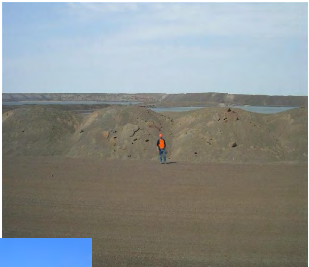
Tailings and tailings ponds at Minntac, MN iron mine

Tailings are usually mixed with water to create a slurry, which is carried through pipes and discharged into tailings basins. Dry disposal of tailings is possible but is expensive because of the cost of dewatering the tailings before stacking. 7 Dry stacking is a relatively new approach that has been used for higher value ores such as those at copper and gold mines. Gogebic Taconite has suggested that dry stacking