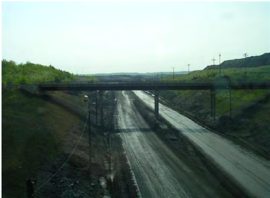
Haul road at taconite mine in Minnesota.

Unfortunately, mine wastes often do not have characteristics favorable for plant growth. In Minnesota, where tailings basins and stockpiles are large, biosolids (i.e. solids from sewage treatment plants), are sometimes applied to increase soil fertility and promote plant growth. If not adequately revegetated, these areas are prone to wind and water erosion 13 .