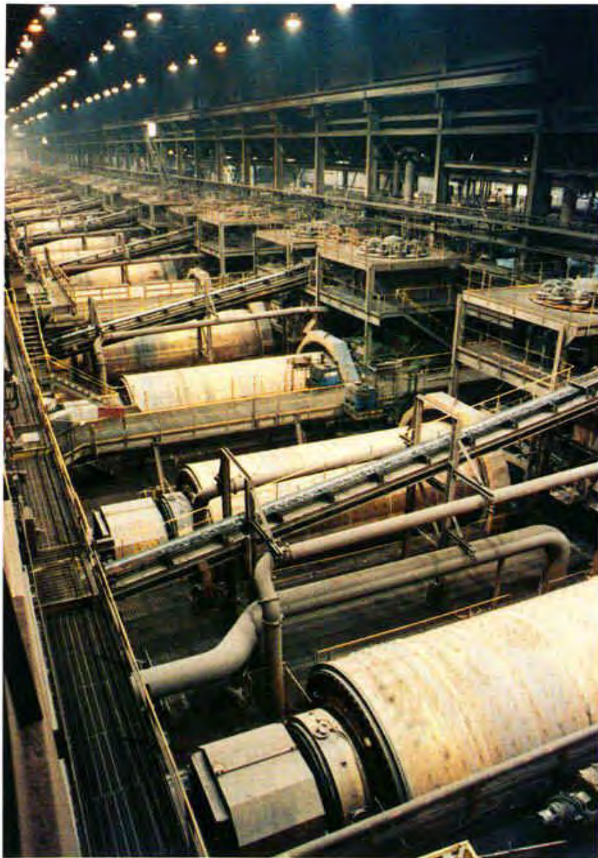
Ore grinding mills. 2

Open pit taconite mines result in permanent changes to the landscape. In Michigan and Minnesota, taconite pits and waste storage sites are permanent features that cover hundreds of square miles. Without additional information, it is unclear what the footprint of a taconite mine project in the Penokee Range would be, but it is clear that a portion of the Range and the resources and habitats that it now supports would be permanently removed.