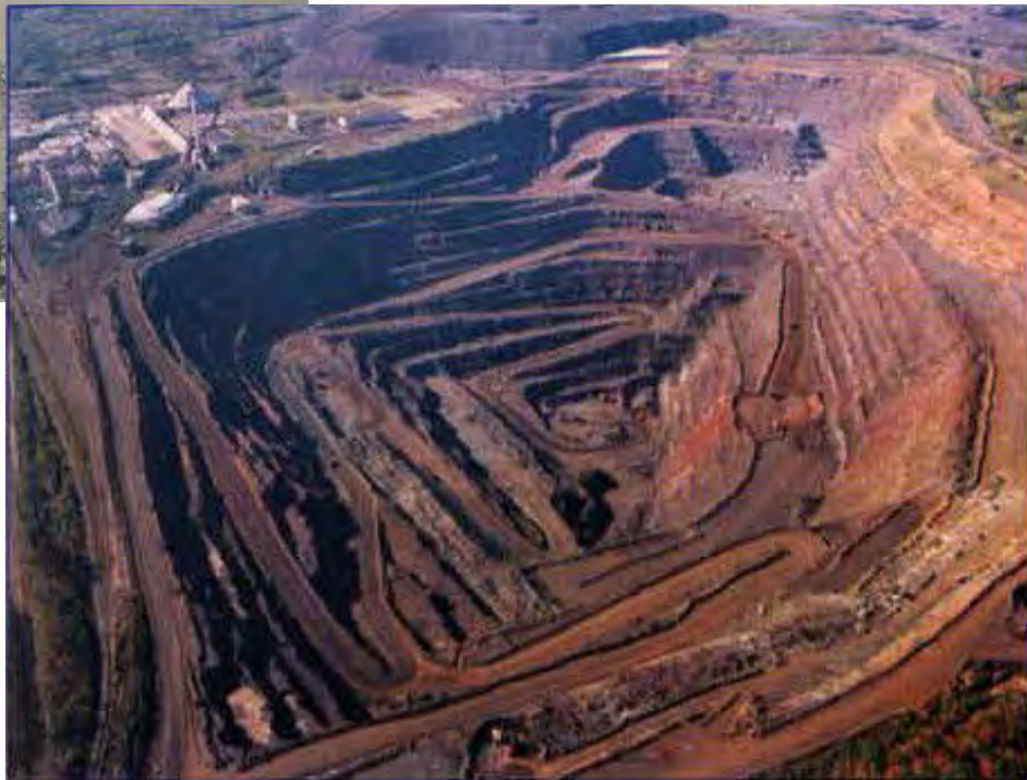
The Tilden Iron Mine, Michigan. 2

Taconite ore is attracted by magnets and is known as magnetite. Magnetite occurs extensively in the Minnesota Iron Range, the Michigan Iron Range near Marquette and Wisconsin's