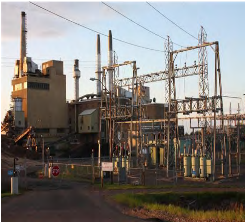
The power plant in Ashland, WI has a output capacity of 76 megawatts. 12